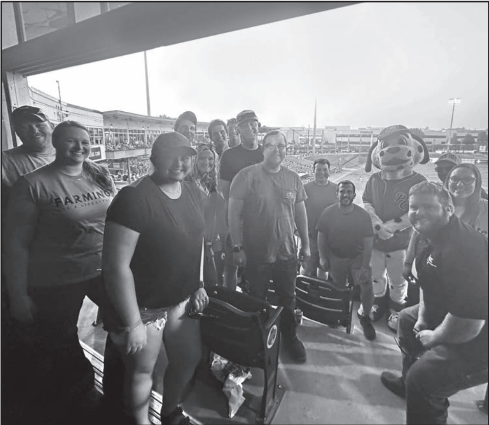
Young Leaders Chiefs Outing The FCFB Young Leader committee enjoyed an evening at the Peoria Chiefs’ game on June 30th. The outing included all of the IFB District 8 County Farm Bureau YL groups, as well as those from IFB District 7. The group is pictured here in their party suite with “Homer”!