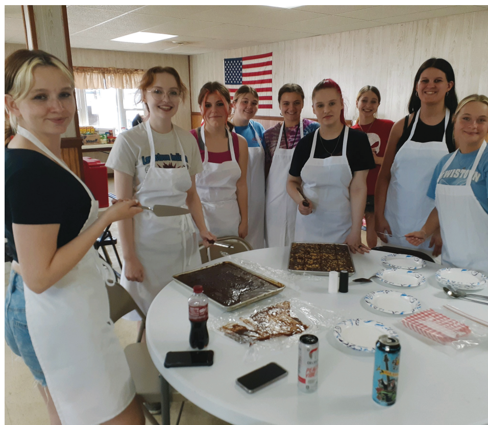
The Lewistown High School Foods Class along with the Illinois Pork Producers provided food to individuals impacted by the April 4 EF3 tornado that struck Lewistown and Bryant areas.

We would like to thank ALL OF OUR DONORS for making this community service opportunity possible!